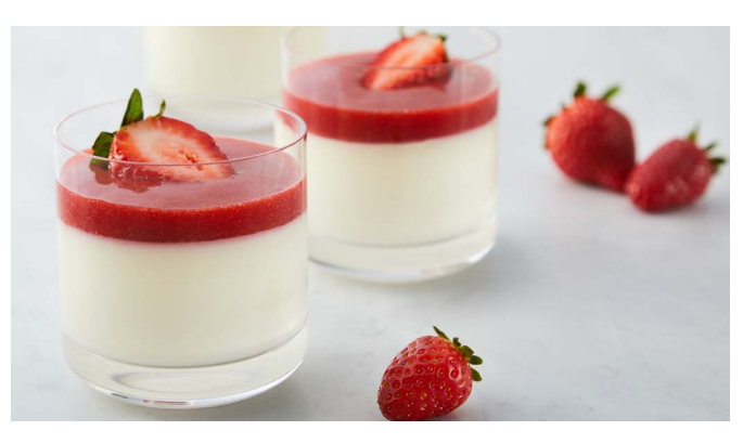
Anchor<sup>™</sup> Chef's Heavy Cream can be whipped to create delicious desserts.