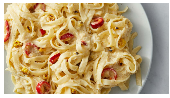
Use to create delicious sauces, pasta dishes and soups.

Anchor<sup>™</sup> Chef's Creams save time, labor and product cost since they are pre-reduced. Ideal for a wide range of applications including acidic and spicy recipes, the creams have excellent heat stability and consistency, and hold up well in heat-reheat operations. Reduce waste from cream breaking, and ensure consistency from chef to chef and across locations with our high performance culinary creams. Available in both 36% fat and 20% fat versions.