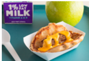
Cheddar and Sausage Breakfast Taco