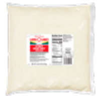
Ultimate Creamy White™