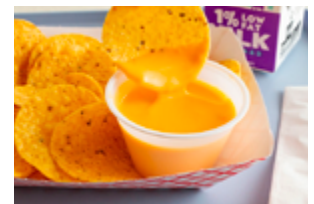
Chips and Queso