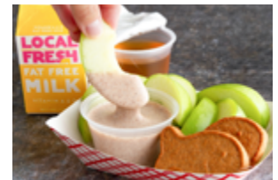
Sweet and Savory Cinnamon Dip