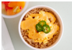
Spicy Breakfast Bowl