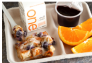
Glazed Blueberry French Toast